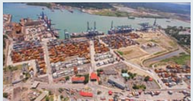
PPC - Port of Balboa

PPC manages and operates the ports of Balboa and Cristobal, located on the Pacific and Atlantic side of the Panama Canal, respectively. These world-class facilities are connected by a railroad and serve as a one-stop shop for trans-shipment and logistic services in Latin America and the Caribbean, both for inbound and outbound trade.